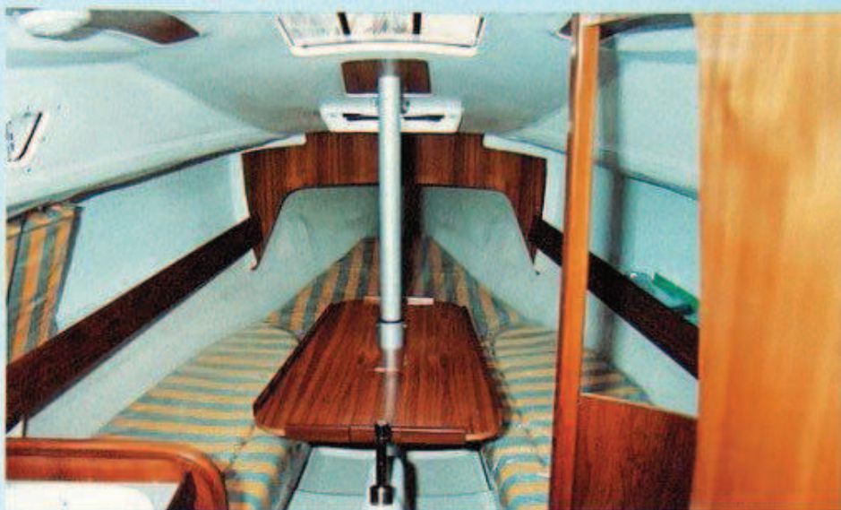
The Beneteau 235 has a big, open interior with comfortable sleeping and seating. The dinette table drops down and gives a full double bunk. And this is not the only one! There is another aft, under the cockpit.

The cockpit is large and has a cut-away section