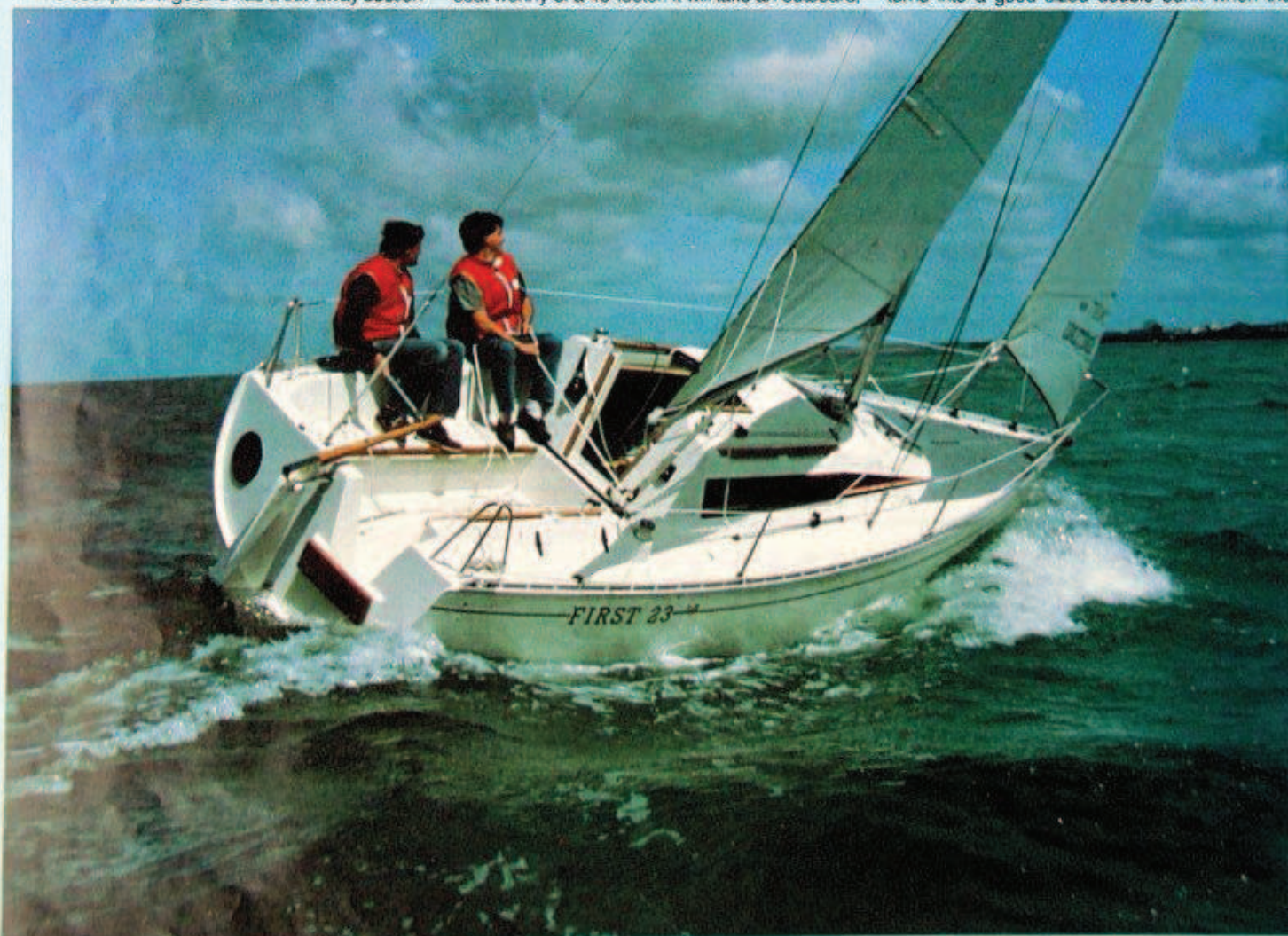
The Beneteau 235 is impressively stylish.

Below decks, all the experience of Beneteau is evident. Right forward you find a "V" berth that turns into a good sized double bunk when the